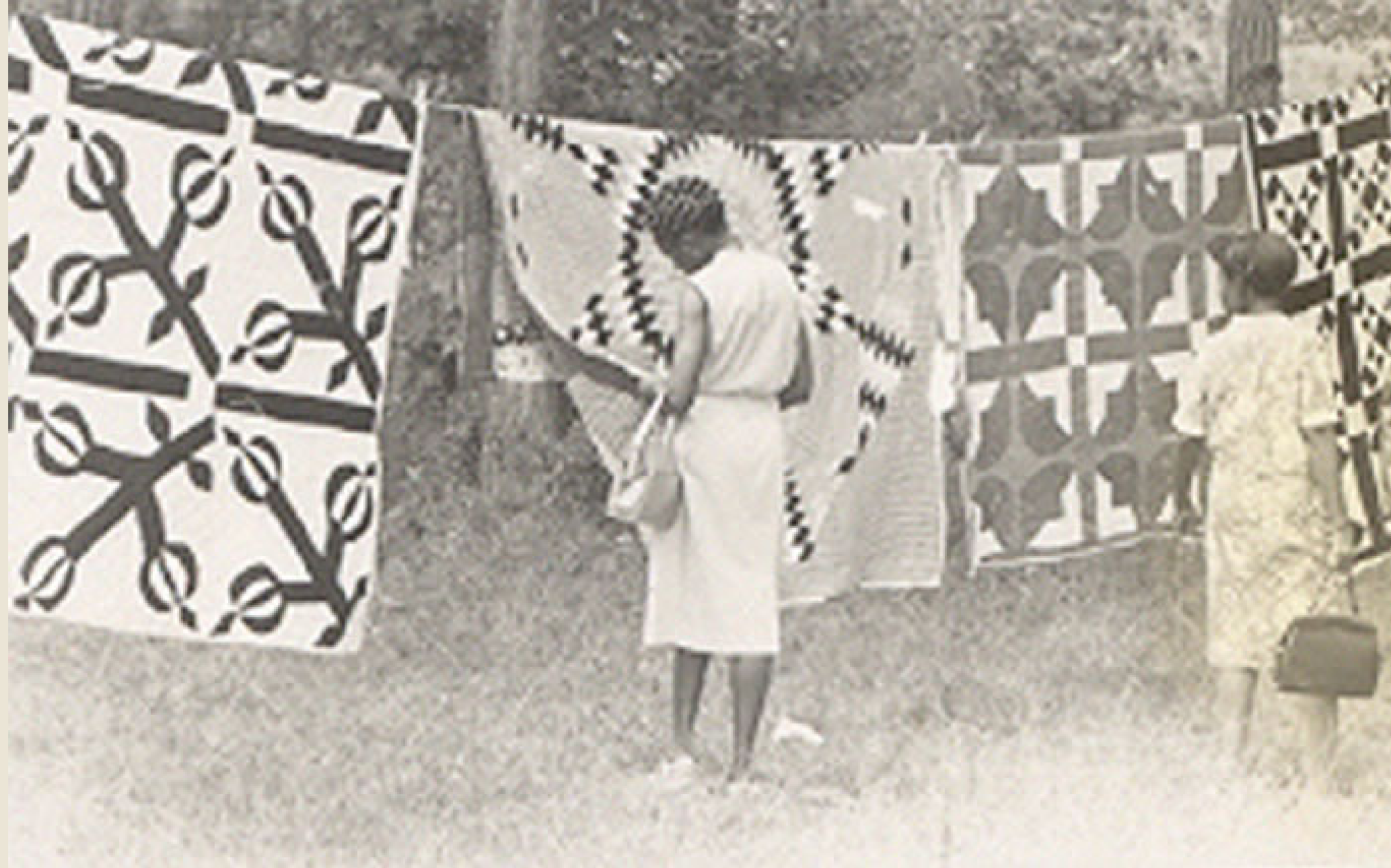
Freedom Quilting Bee Cooperative 1966 - 2012

“Members understood that they could make more progress by working together and helping one another, and they exhibited strong racial solidarity as they witnessed ways in which they were all weak if one was weak.”